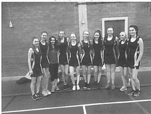
S3 Netball team

Cross country was more popular this year with several different course options to bring out the competitive spirit in our pupils. Most of our pupils improved on their times week-by-week during the cross country block which was great to see. On Wednesday 1 March our Junior Cross Country team will be competing in the Secondary Schools Cross Country Championships and we wish them the very best of luck.