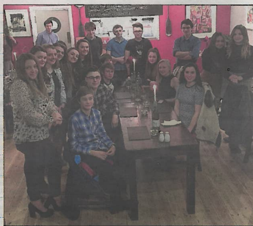
GOING CONTINENTAL: The French and Spanish classes: