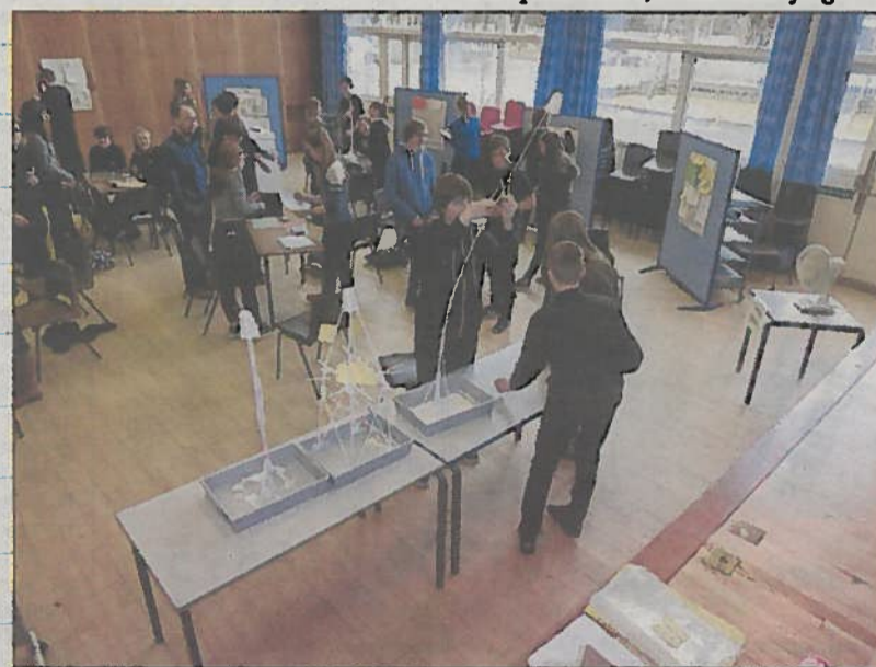
APPLIANCE OF SCIENCE: The pupils at work on the Crest Award projects.

S3 pupils were participating in the Crest Award, an engineering activity which they do in teams of 5/6 five or six which incorporates many skills ranging from technology (structures), art and design (design logos, flags and artistic