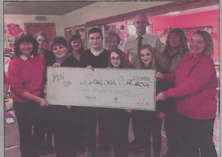
YOUTH PHILANTHROPISTS: Local social concern's their strong point...

PUPILS in S2 have been engaging with charities addressing areas of local social concern in our community, using their research and literacy skills to create presentations. A wide range of charities were contacted and visited all around the community, with pupils being able to see how the charities were supporting people in a variety of different ways.