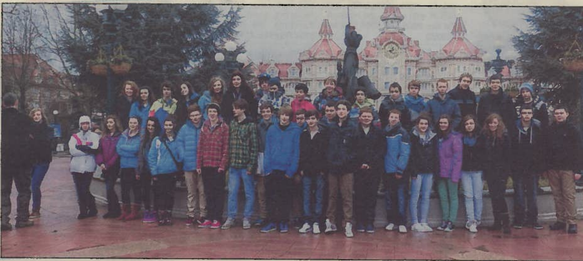
IS MICKEY MOUSE ABOUT?: Pupils from S3 gather for a momento photo at Euro-Disney

FOR the last few years GGS has also run a S3 trip to Euro-Disney. The trip is organised jointly between the maths and technology department.