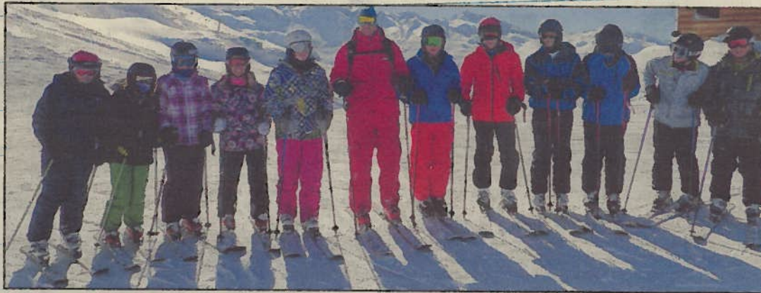
HITTING THE HEIGHTS: A holiday snap of the Grantown pupils in 'Les Menuires' in the French Alps.